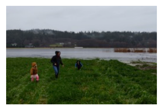
Contaminated water floods family farms

Of the six chemicals found, PFHXS found at the highest level—up to 90.8 parts per trillion (ppt). PFHXS is linked to child development and other health problems and takes about 8 years for the body to rid itself of just half of what it accumulated. PFOA is found up to 39.3 and PFOS up to 143 ppt. The total of all PFASs in a monthly sample has been as high a 266.7 ppt.<sup>68</sup>