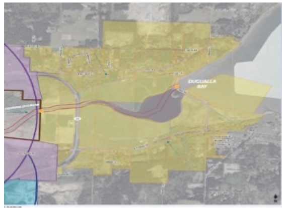
Yellow area - potentially contaminated properties.<sup>1</sup>

Navy says it is "committed to open and transparent communication regarding this [PFAS] issue." Its conduct says otherwise.